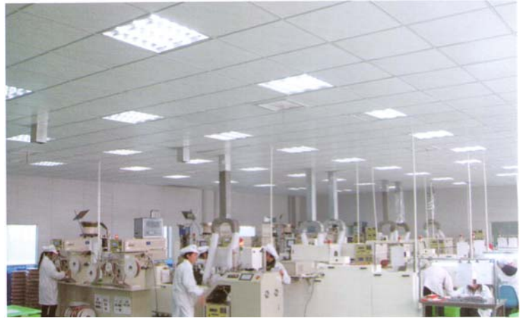
Semi-conductor Plant in Taiwan