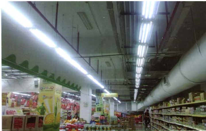
Large Supermarket in Taiwan