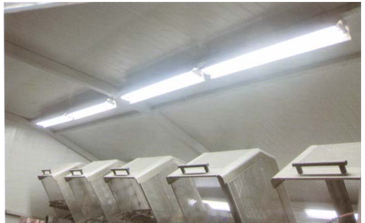
Tile Factory, Suzhou, China