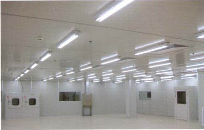
Transcend Optronics, Yangzhou, China