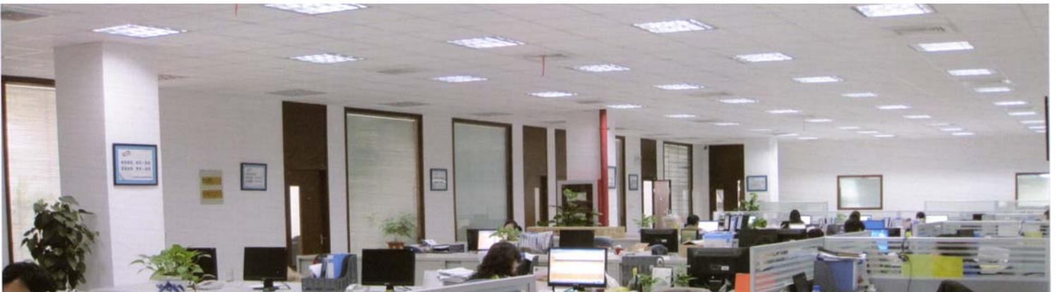
Company Office in Taipei, Taiwan